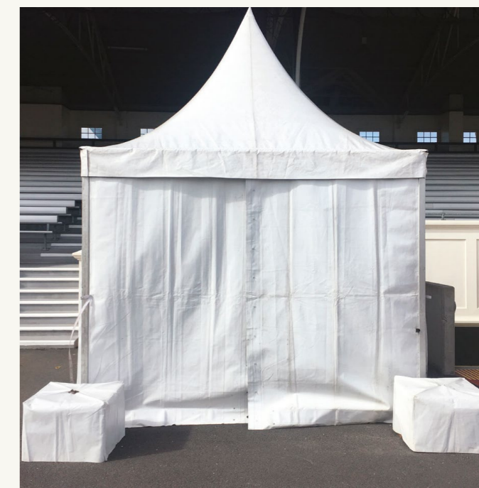
Indicative image only

Melbourne Royal recommends the use of professional stand designers and construction specialists.