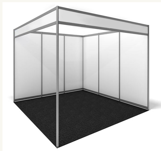
Indicative image only

If allocated a premium or corner site, an additional levy of $950.00 (incl. GST) will be charged.