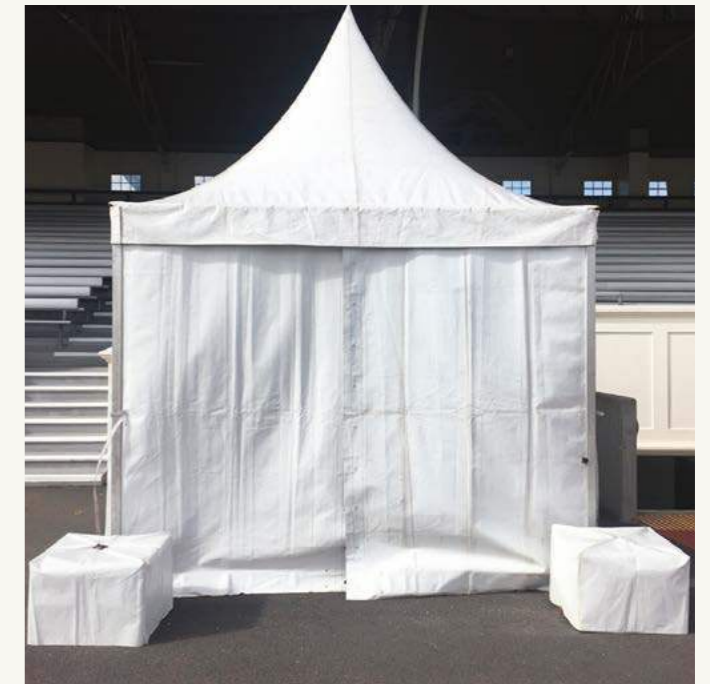
Indicative image only

Melbourne Royal recommends the use of professional stand designers and construction specialists.