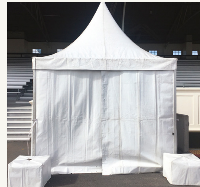
Indicative image only